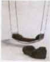
INDUSTRIAL CHIC JM ZIVIC'S COAL TABLES AND LEATHER LINK HAMMOCK AT RALPH PUCCI INTERNATIONAL.