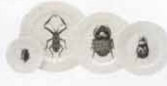
BUGS, ETC. INSECTS AND ALL NATURAL CURIOSITIES, REETLE PLATES BY LAURAZINDEL.