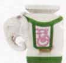
LILLY PULITZER THE 1980S LEGEND INSPIRES NEW HOME COLLECTION THE HEIRESS STOOL FROM LILLY PULITZER.