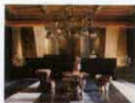
VICEROY ANGUILLA INTERIOR DESIGN BY KELLY WEARSTLER.