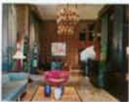
VICEROY MIAMI INTERIOR DESIGN BY KELLY WEARSTLER.