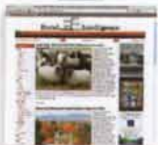
RURALINTELLIGENCE.COM A SMALL-TOWN NEWSPAPER FOR THE DIGITAL AGE.