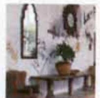
THE MELROSE PROJECT TOMMY AND KATHLEEN CLEM BRING VERYPOODY'S SPIRIT TO WEST HOLLYWOOD.