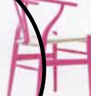
WISHBONE CHAIR HANS JONER'S MIDCENTURY CLASSIC, NOW IN PINK FROM SUITE NEW YORK.