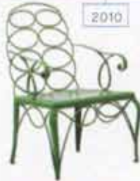
WHAT'S OLD IS NEW L.A.-BASED DOWNTOWN REINTERPRETS ELKINS'S ORIGINAL FOR OUTDOOR LIVING.