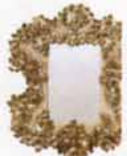
ROCCO REDUX NEUTRAL NATURALS, STE. MIRROR FROM MADE GOOD.