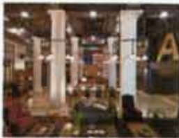
ACE HOTEL NYC ROMAN & WILLIAMS DESIGN THE ULTIMATE MPETER HANDOUT.