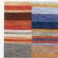
HOOKEED RUGS COTTAGE CRAFT WITH A MODERN SPIN, RED SPRUCE COLLECTION FOR ODEGARD.