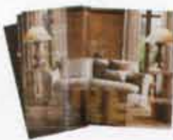
RESTORATION HARDWARE THE BELGIAN LOOK HITS THE BIG TIME.