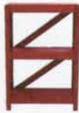
BUTCH REFINED ADD A BIG SHOT OF COLOR PAINTED PINE SHELVING UNIT BY PETER MARINGOLD FROM MOSS.