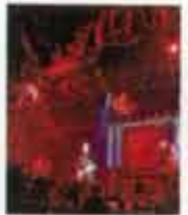
BLOODY BLOOD ANDREW JACKSON OPENS ON BROADWAY SETS BY DONALD WEN.