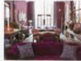
CROSBY STREET HOTEL A LITTLE LESS INDUSTRIAL, A LOT MORE COLORFUL INTERIOR DESIGN BY KIT KEMP.