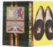
TRUE PREP AN UPDATE OF THE ORIGINAL PREPPY HANDBOOK—MORE OF WHAT YOU LOVED.